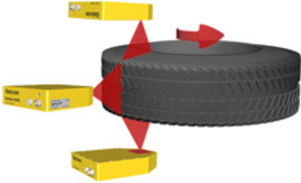
Figure 2: Tire Final Inspection System

The platform also provides tools for multi-sensor position calibration using an appropriate artifact of known dimensions that is placed in the system measuring area. This process locates each sensor's position with respect to a global coordinate system defined relative to the target. Transformation parameters for each sensor in the system are acquired during the system calibration process and are used to transform profile data from the multiple sensors into a single coordinate system.